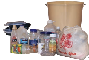
Empty plastic containers, bags, small items

Bag in one bag bread, produce, meat and other plastic bags and film. Put in container. To cut litter and increase diversion, no loose bags, please!