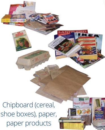
Chipboard (cereal, shoe boxes), paper, paper products