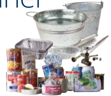
Empty cans, small metal items