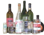
Empty glass containers