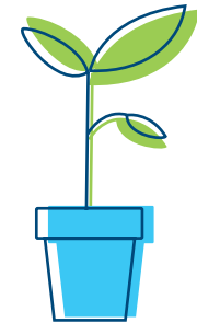
Plant/seeds & soil