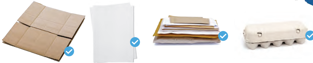
Cardboard & Paper