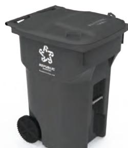
95-gallon equal to 3 trash cans