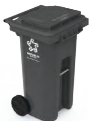
48-gallon equal to 1 1/2 trash cans