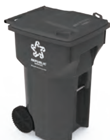
65-gallon equal to 2 trash cans