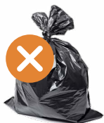
Non-compostable plastic trash bags