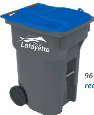
96-gallon recycling cart