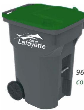
96-gallon compost cart