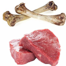
Bones & Meat