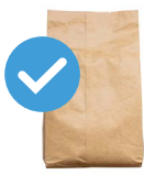
Paper yard waste bags