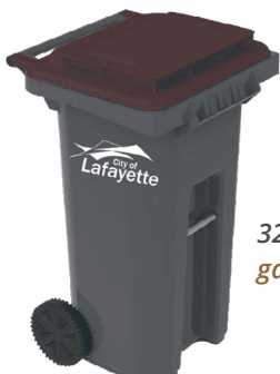
32-gallon garbage cart

Please ensure all material fits inside your cart with the lid closed. If your lid is open, no collection will occur.