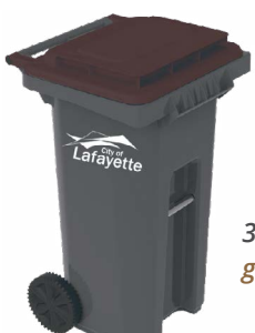
32-gallon garbage cart

Please ensure all material fits inside your cart with the lid closed. If your lid is open, no collection will occur.