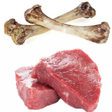
Bones & Meat