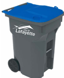
96-gallon recycling cart