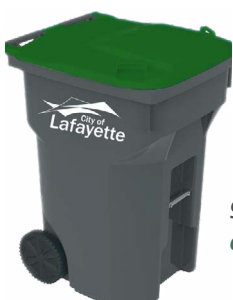
96-gallon compost cart