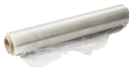
Packing materials (bubble wrap, plastic wrap, packing peanuts and Styrofoam™)