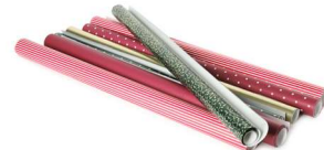
Wrapping Paper (foil or plastic-coated)