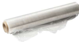
Packing materials (bubble wrap, plastic wrap, packing peanuts and Styrofoam™)