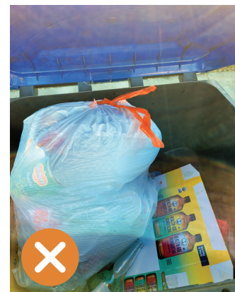
Don't place recyclable materials in plastic bags.

Electronic waste (e-waste) cannot be disposed of in the recycling, trash or organics carts. Fairfield residents can drop off small appliances and e-waste at the Republic Services facility located at 2901 Industrial Court, Fairfield. The facility is open Monday-Friday, 8 a.m.-4 p.m. (closed for lunch from 11:45 a.m.-1 p.m.) Fairfield residents can bring up to five (5) e-waste items per visit. All batteries must be removed, and the weight limit is 60 pounds. Medical equipment is not accepted.