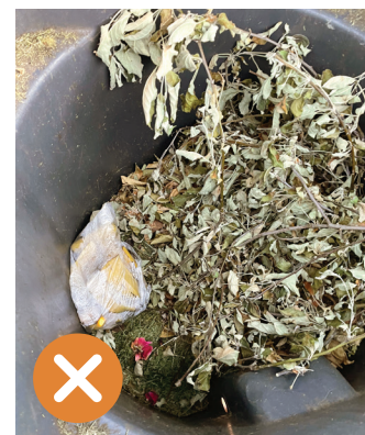
Don't place plastic bags in the organics cart.