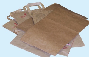
brown paper bags