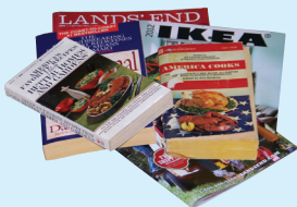
soft cover books & catalogs