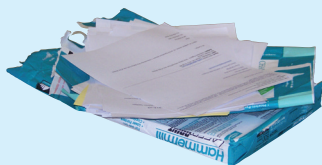
copy paper & ream wrappers