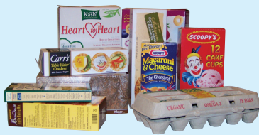
cartons & frozen food packaging