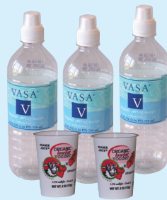
empty plastic containers