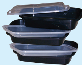
takeout plastic food containers (rinsed)