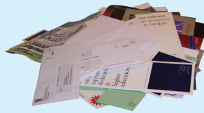
junk mail, flyers, brochures