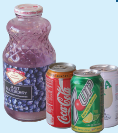
empty cans, glass bottles & jars