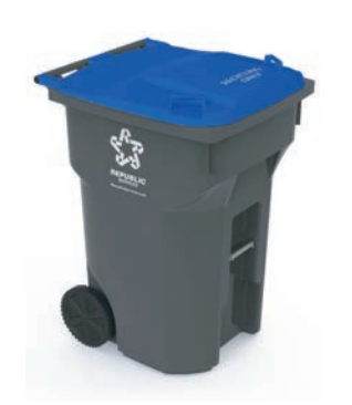
96-gallon 40.7" H x 28" W x 32.1" D Holds ten 13-gallon trash bags

The standard cart size is 96 gallons . Smaller carts are available in 35-gallon and 64-gallon sizes. Rates do not vary based on cart size.