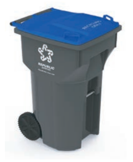
64-gallon 39.1" H x 24.4" W x 27.5" D Holds six 13-gallon trash bags