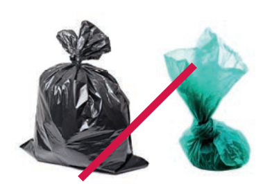
Trash & Pet Waste