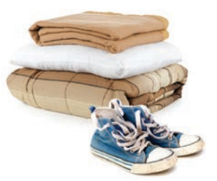
Clothing & Bedding