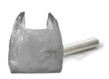
Plastic Bags & Wrap