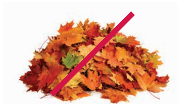
Yard & Food Waste