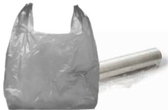
Plastic Bags & Wrap