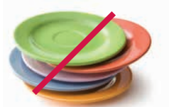
Dishes & Mirrors