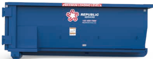
10-yard roll-off (12'8" L x 8'3" W x 4'4" H)