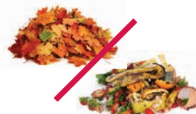
Yard & Food Waste