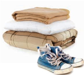
Clothing & Bedding