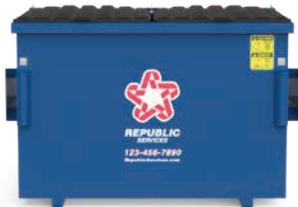
3-yard bin (80" L x 42" W x 46" H)