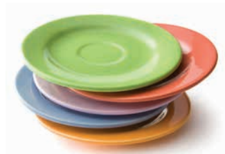
Dishes & Mirrors