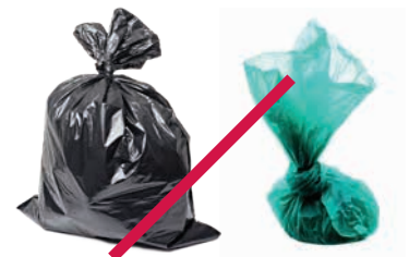
Trash & Pet Waste