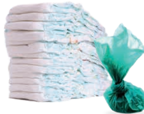
Diapers & Pet Waste