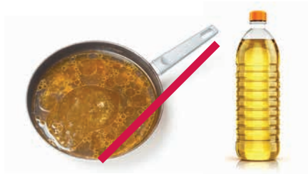
Fats, Oils & Grease