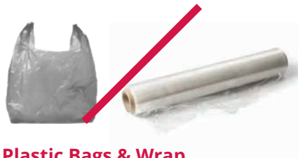
Plastic Bags & Wrap