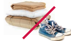
Clothing & Bedding