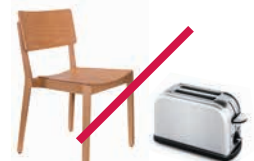
Furniture & Appliances