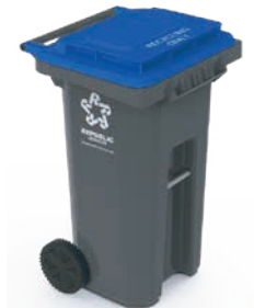
35-gallon 36" H x 19.7" W x 26.3" D Holds three 13-gallon trash bags