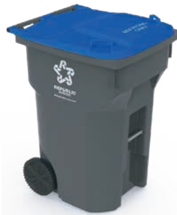
96-gallon 40.7" H x 28" W x 32.1" D Holds ten 13-gallon trash bags

The standard cart size is 96 gallons . Smaller carts are available in 35-gallon and 64-gallon sizes. Rates do not vary based on cart size.