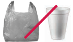
Plastic Bags & Styrofoam®