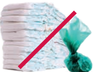
Diapers & Pet Waste