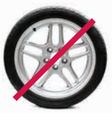
Tires & Auto Parts