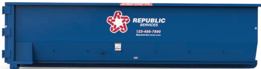
30-yard roll-off (23'1" L x 8' W x 6'1" H)