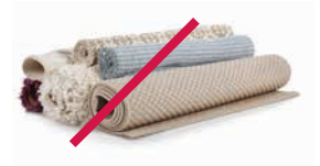
Carpet & Rugs