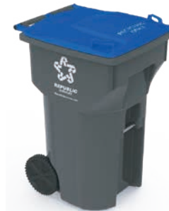
64-gallon 39.1" H x 24.4" W x 27.5" D Holds six 13-gallon trash bags