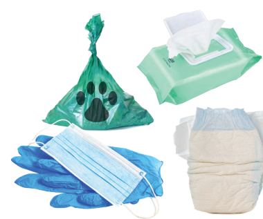
Diapers, Pet Waste & Personal Hygiene Products