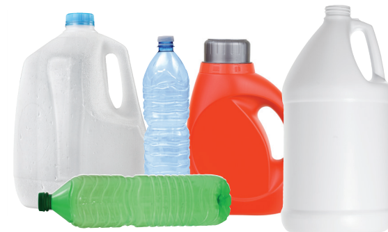
Rigid Plastic Containers ♻️ ♻️