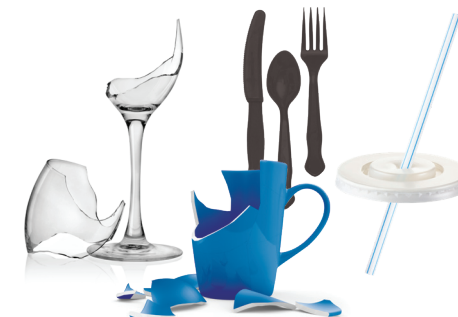
Broken Glassware & Ceramics Plastic Utensils & Plastics ♻️ ♻️