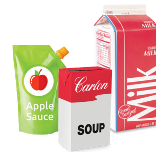
Lined Food & Beverage Cartons & Pouches

Non-recyclable and non-compostable items only. Eliminate single-use plastic waste by choosing durable, reusable products.