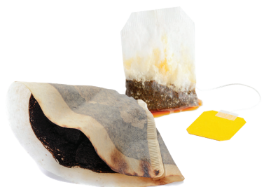
Coffee Grounds, Tea Leaves, Paper Filters & Teabags