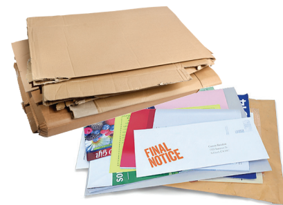
Cardboard & Mixed Paper

Keep recyclables clean, dry and empty. Do not bag items.