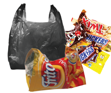
Plastic Bags & Wrappers, Snack Packaging