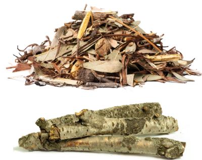
Yard Trimmings & Untreated Wood