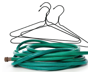
Hoses & Wires