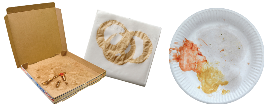
Food/Grease-Soiled Paper & Paper Products