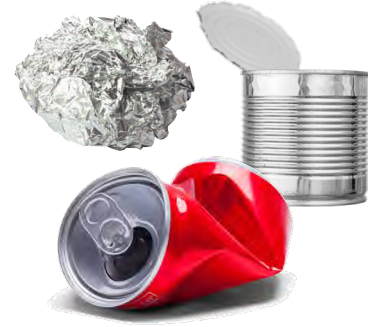
Metal Cans, Scrap & Trays