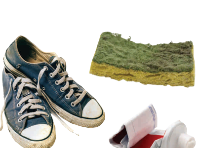
Other Household Items