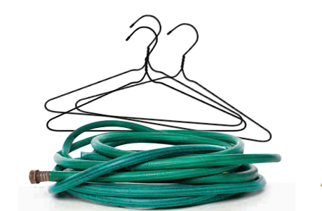
Hoses & Wires