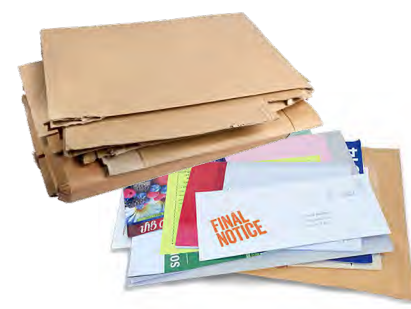
Cardboard & Mixed Paper

Keep Recyclables Clean, Dry and Empty. Do Not Bag Items.