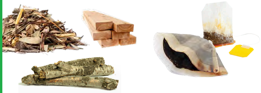
Yard Trimmings & Untreated Wood