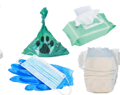
Diapers, Pet Waste & Personal Hygiene Products