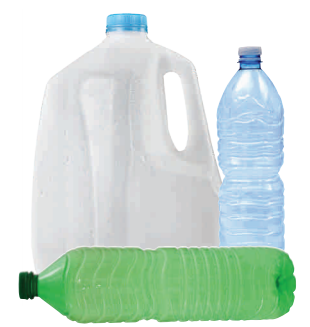
Plastic Bottles ♻️-♻️