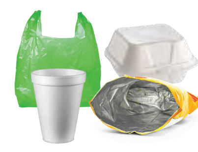
Plastic Bags & Wrappers Styrofoam Products