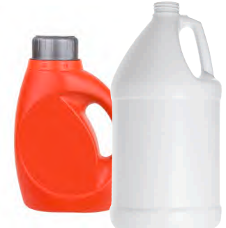
Rigid Plastic Containers ♻️-♻️