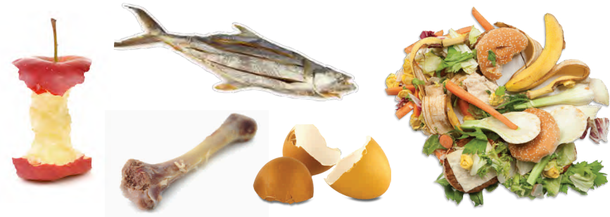
All Food Scraps: Fruits, Vegetables, Meat, Seafood, Bones, Shells, Dairy & Bread

Do Not Bag Items in Non-Compostable Plastics Bags. Visit StopFoodWaste.org to Learn How to Reduce Food Waste.