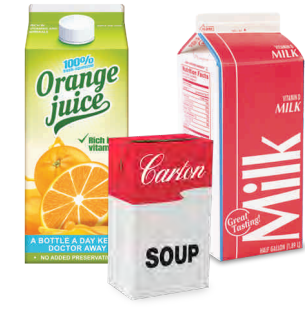
Lined Food & Beverage Cartons & Pouches

Non-Recyclable and Non-Compostable Items Only. Eliminate Single-Use Plastic Waste by Choosing Durable, Reusable Products.