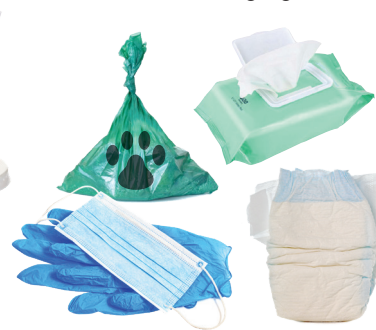
Diapers, Pet Waste & Personal Hygiene Products