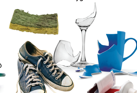
Other Household Items