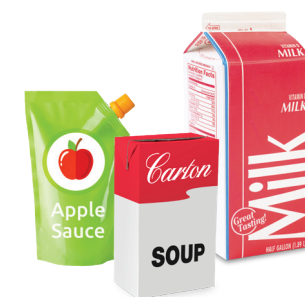
Lined Food & Beverage Cartons & Pouches

Non-Recyclable and Non-Compostable Items Only. Eliminate Single-Use Plastic Waste by Choosing Durable, Reusable Products.