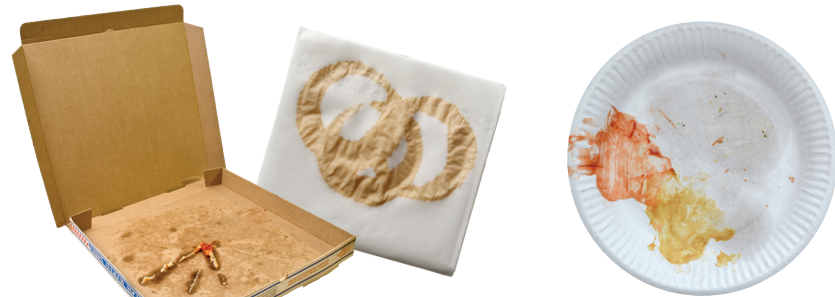
Food/Grease-Soiled Paper & Paper Products