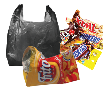
Plastic Bags & Wrappers, Snack Packaging