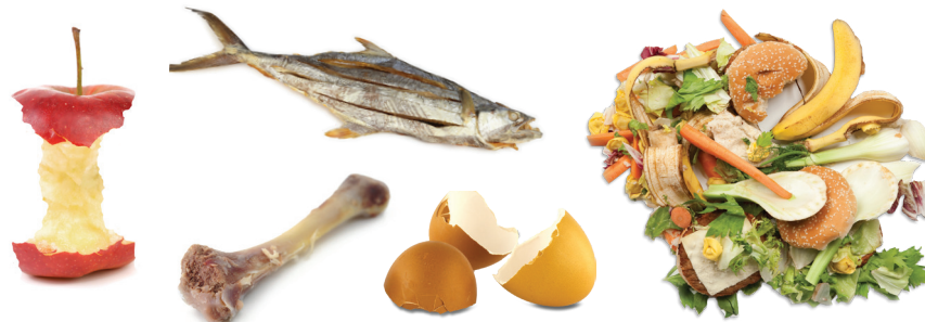
All Food Scraps: Fruits, Vegetables, Meat, Seafood, Bones, Shells, Dairy & Bread

Line your kitchen pail with paper towels, newspaper, craft paper, or egg cartons to keep it tidy. Plastic bags are prohibited. Visit StopFoodWaste.org to Learn How to Reduce Food Waste.