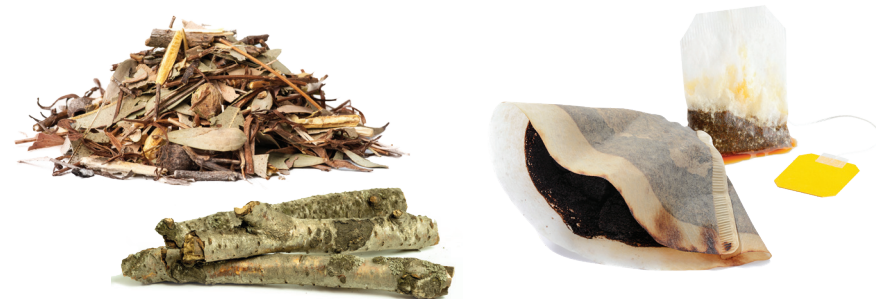
Yard Trimmings & Untreated Wood