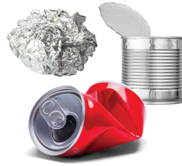
Metal Cans, Scrap & Trays