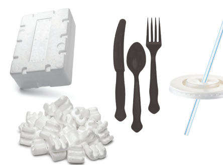
Plastic Utensils & Plastics Styrofoam Products