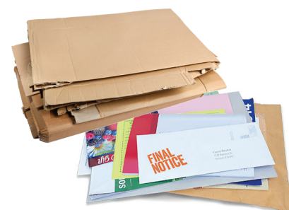
Cardboard & Mixed Paper

Keep Recyclables Clean, Dry and Empty. Do Not Bag Items.