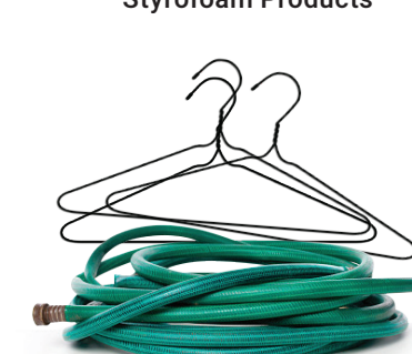
Hoses & Wires