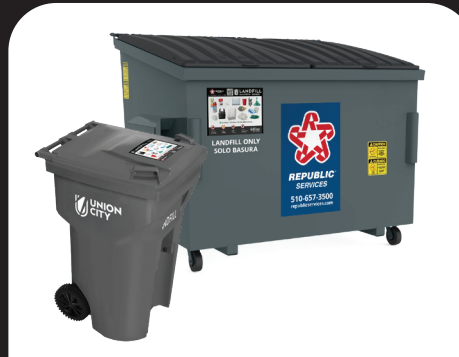
Acceptable in your landfill cart/bin: Lined Food & Beverage Cartons & Pouches. Plastic Bags & Shrink Wrap. Plastics 3–7 & Plastic Utensils. Styrofoam Products. Broken Glassware & Ceramics. Diapers, Pet Waste & Personal Hygiene Products. Hoses & Wires. Other Household Items.