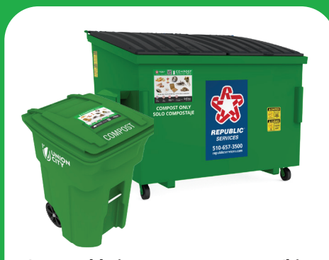
Acceptable in your compost cart/bin: All Food Scraps: Fruits, Vegetables, Meat, Seafood, Bones, Shells, Dairy & Bread. Yard Trimmings & Untreated Wood. Coffee Grounds, Tea Leaves, Paper Filters & Teabags. Food/Grease-Soiled Paper.