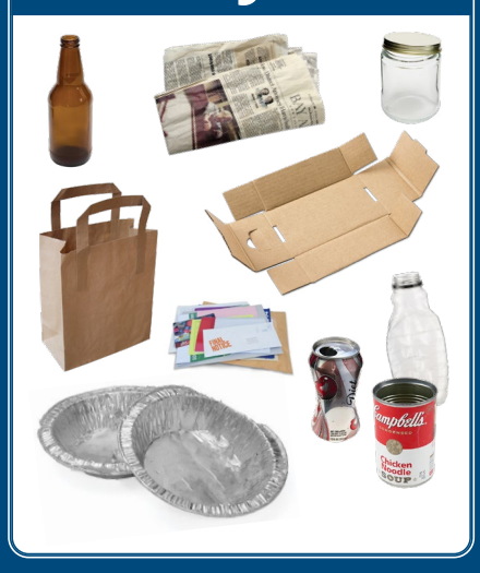
Empty, Clean, and Dry