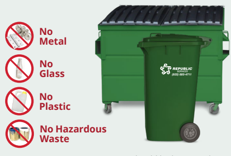
Organics should be loose (no bags) or in compostable or paper bags only. No plastic bags.