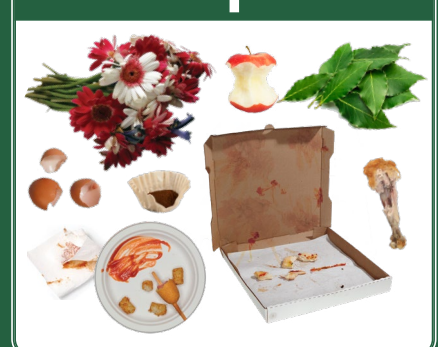
BAGS: Compostable BPI (meets ASTM 6400 Standard); Paper Bags; No Bags