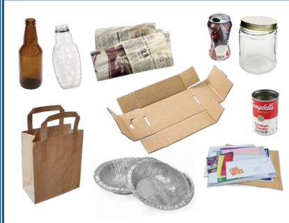
Empty, Clean, and Dry