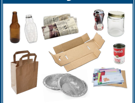
Empty, Clean, and Dry