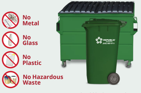
Organics should be loose (no bags) or in compostable or paper bags only. No plastic bags.