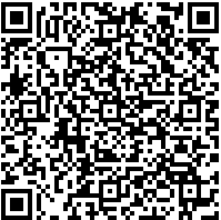
Multifamily Compost and Recycle Form