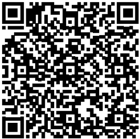
Multi-Family Move-Out Handout