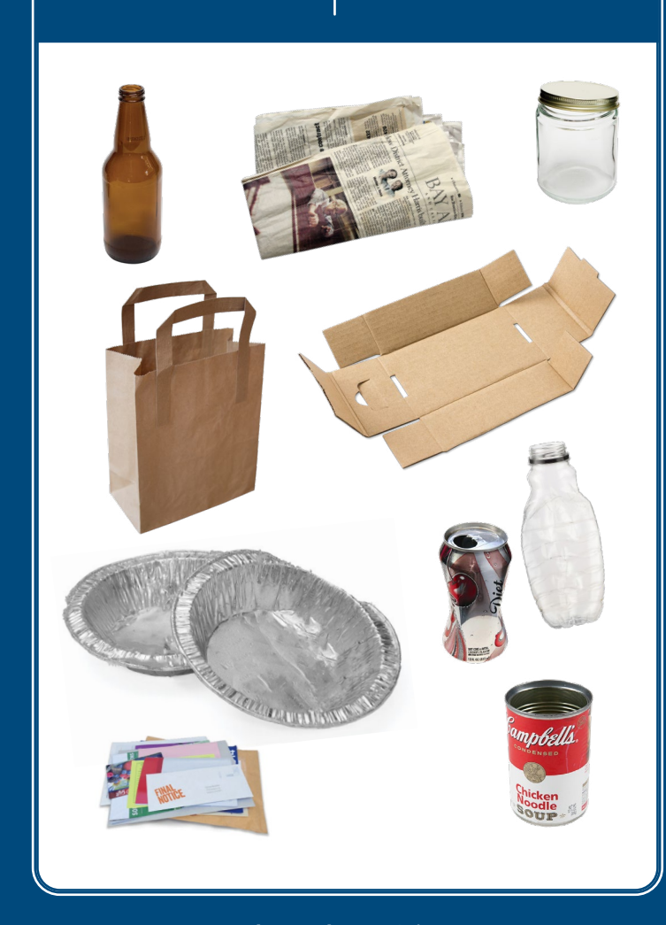
Empty, Clean, and Dry Vacío, limpio y seco