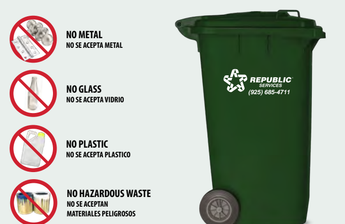
Recyclables should be loose (no bags) or placed in a clear bag only.

Organics should be loose (no bags) or in compostable or paper bags only. ⊘ No plastic bags. ⊘ No compostable plastic.