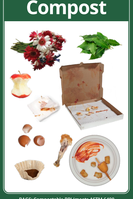
BAGS: Compostable BPI (meets ASTM 6400 Standard); Paper Bags; No Bags