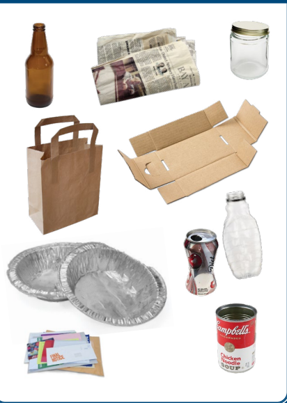
Empty, Clean, and Dry