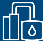
INJECTION WELL DISPOSAL