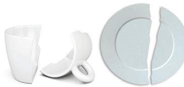
Dishes and Mirrors