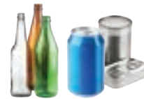
Glass and Cans