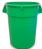
32-GALLON ROUND W/ LID 28" H