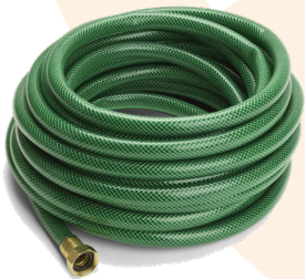
ROPES, CHAINS, CORDAGE, GARDEN HOSES