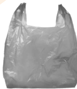
PLASTIC SHOPPING BAGS