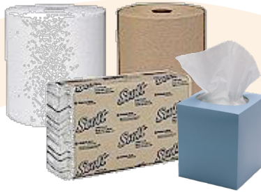
TISSUE, PAPER TOWELS OR NAPKINS